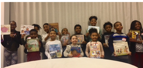
The group of children reading presented 14 culturally diverse literature to read and discuss at our grant project on Saturday, February 10, 2018.